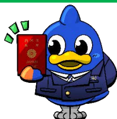
Tokyo Regional Immigration Bureau character "Toribu"