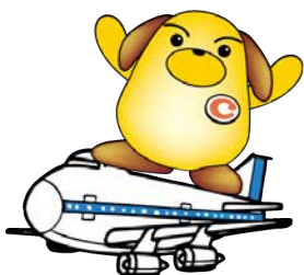
Customs' official character Custom-kun