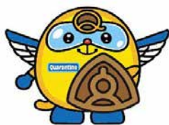
Quarantine station Official character "Quaran"

Narita Airport Quarantine Station • Narita Airport Branch of the Tokyo Immigration Bureau Animal Quarantine Service Narita Branch • Yokohama Plant Protection Station Narita Sub-station • Narita Branch Customs