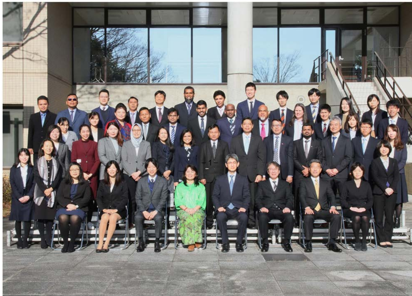
WCO Regional Workshop on AEO: Raising awareness for development of regional cooperation and strategy (16-20 December 2019)

FAA EAST, SOUTH AND SOUTH EAST ASIA, AUSTRALASIA AND THE PACIFIC ISLANDS Japan