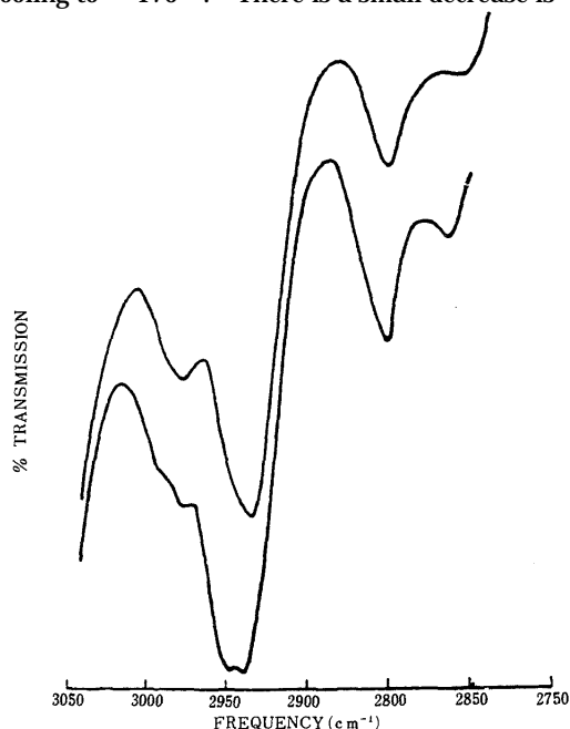
Fig.3. Expanded infrared spectra of polyglycine films in the \text{CH}_2 stretching region : (a) (top curve) at room temperature, (b) (bottom curve) at about - 170 °C .

As can be seen from Figure 1 and Table , the spectrum of polyglycine is altered very little by cooling to - 170 °C . There is a small decrease in