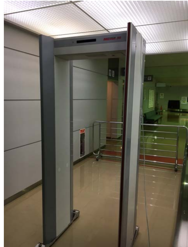
Example of a metal detector gate