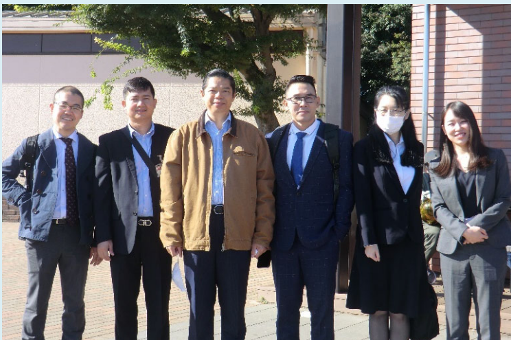
(Workshop for the Cambodia Customs in October)