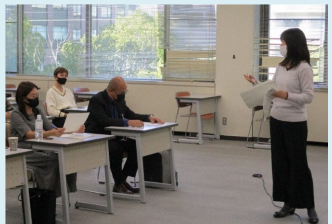
(Workshop for the Philippines Customs in December)