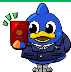
Tokyo Regional Immigration Bureau character "Toribu"