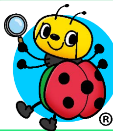
PPS Official character "Pi-Kyun"