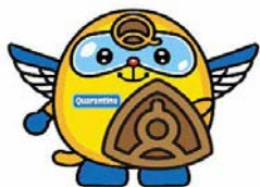
Quarantine station Official character "Quaran"

Narita Airport Quarantine Station • Narita Airport Branch of the Tokyo Immigration Bureau Animal Quarantine Service Narita Branch • Yokohama Plant Protection Station Narita Sub-station • Narita Branch Customs