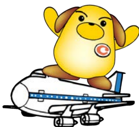
Customs' official character Custom-kun